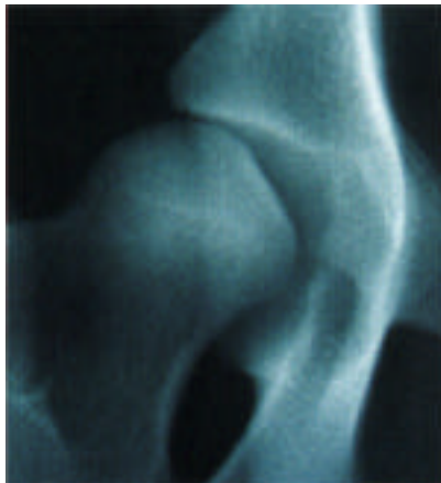
Right hip in close up. Minor degree of hip dysplasia (single hip score:10)

In simplistic terms the genetic code is rather like the architect's building blue prints and, the environment, the builders and their materials. In HD the architect gets things wrong to a greater or lesser extent but the builders have the greater influence on how things look and function in the final analysis.